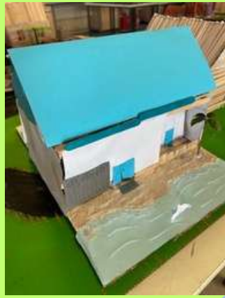
Big ideas, tiny buildings – our Design & Technology class bringing a miniature town to life