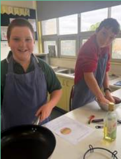
CHOP DICE SLICE